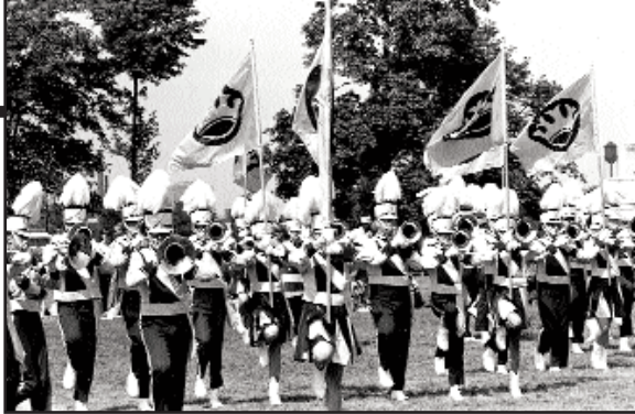
Norwood Park Imperials, 1968, at VFW Nationals in Detroit, MI.

In 1963, when the corps decided to forego