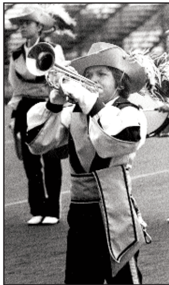
The Imperials, approximately 1980.

Music played during the 1970s included Victory for All, Summertime and Alexander's Ragtime Band (1970-1971); American Overture, Blues in the Night and Birth of the Blues (1972); New World Symphony, MacArthur Park and John Brown's Body (1973).