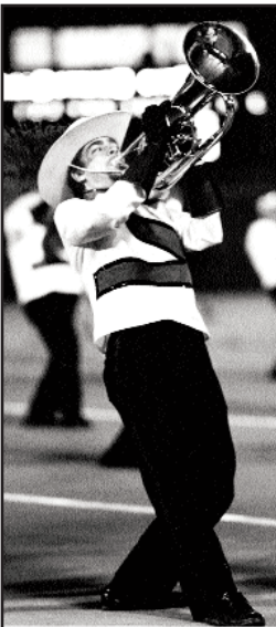
Syracuse Brigadiers, September 5, 1993, at DCA Finals.

The 2000 season was the first in the corps' dominant streak. They went undefeated and won the DCA title by more than two points to a second-place Hawthorne Caballeros. In 2001, it wasn't that much different. They again were able to go undefeated and edged the Reading Buccaneers at the DCA Championships on their home turf in Syracuse.