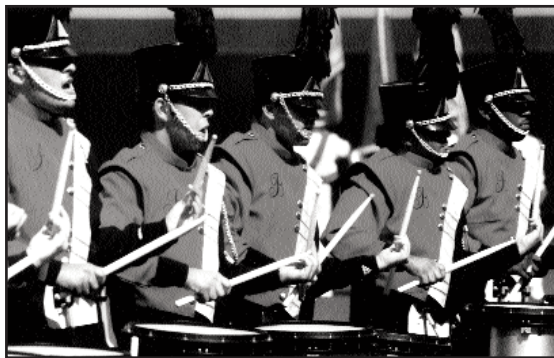
Syracuse Brigadiers, 2002 (photo by David Rice from the collection of Drum Corps World).

past that reflects that this group of musicians, no matter how much more they achieve, will always remember where they came from.