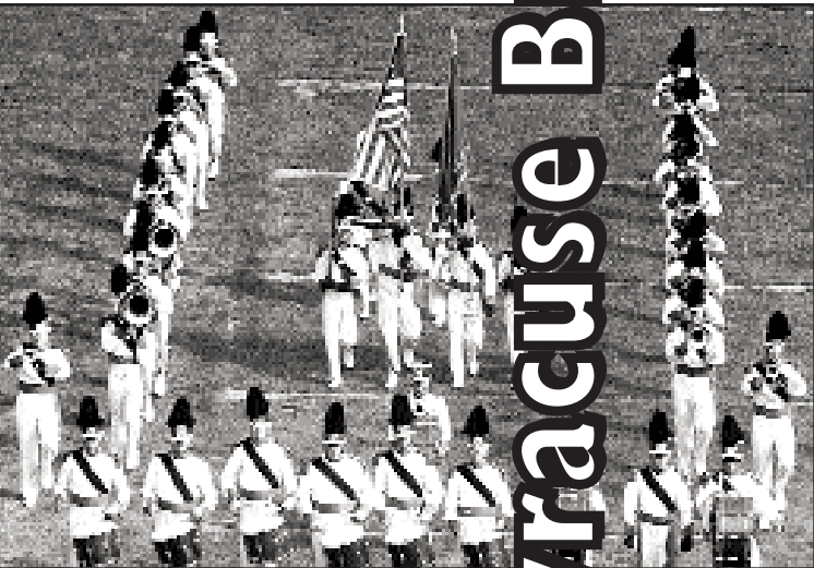
Syracuse Brigadiers, 1964, at Jersey City, NJ.

A success story like this can sometimes be overlooked. It wasn't always this way. Like all things in life, something as sweet