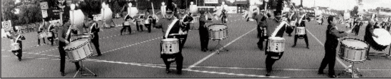
Syracuse Brigadiers, September 1, 2001, at DCA Prelims in Scranton, PA (photo by Moe Knox from the collection of Drum Corps World).