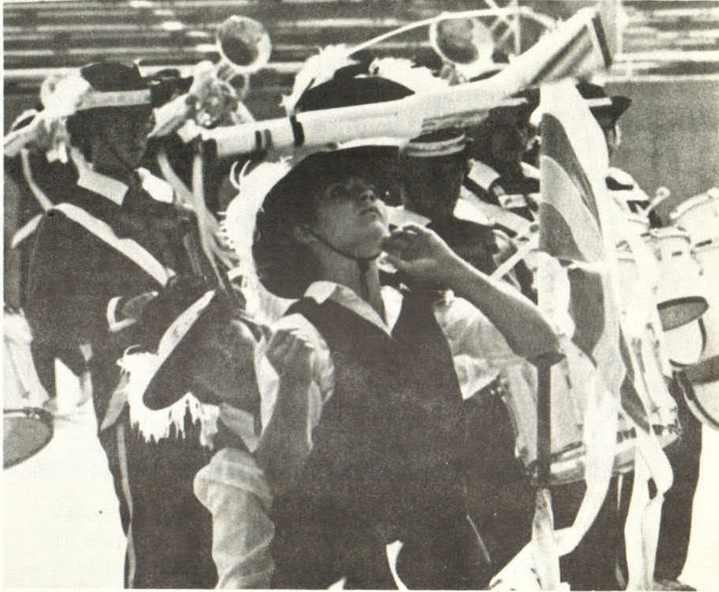
THE 1981 SQUIRES IN COMPETITION A SIGHT WE ALL HOPE TO SEE AGAIN IN THE NEAR FUTURE